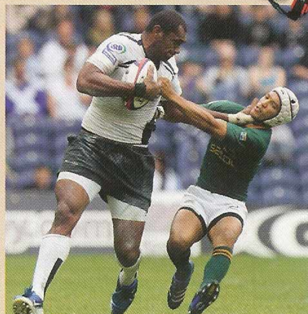
"Shoo, fly-half, don't bother me."